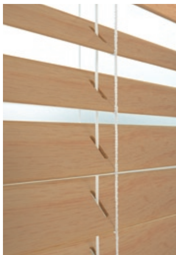
Slat available in 50mm and 64mm

Luxaflex® Woodmates® blinds come with a matching attractive 84mm valance to hide any light gap, and a trapezoid Bottom Rail for improved closure.