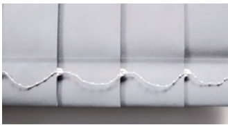
Traditional finishing with weights and chains.