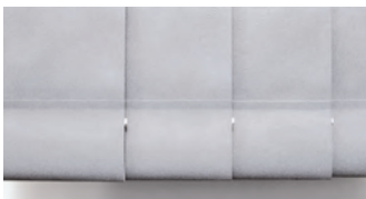
'Earless' weights without chains.