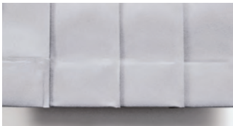
Fully sewn-in weights (additional cost).